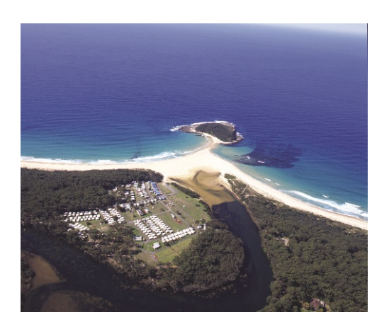
Conceptual Development Plan