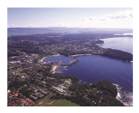
Conceptual Development Plan